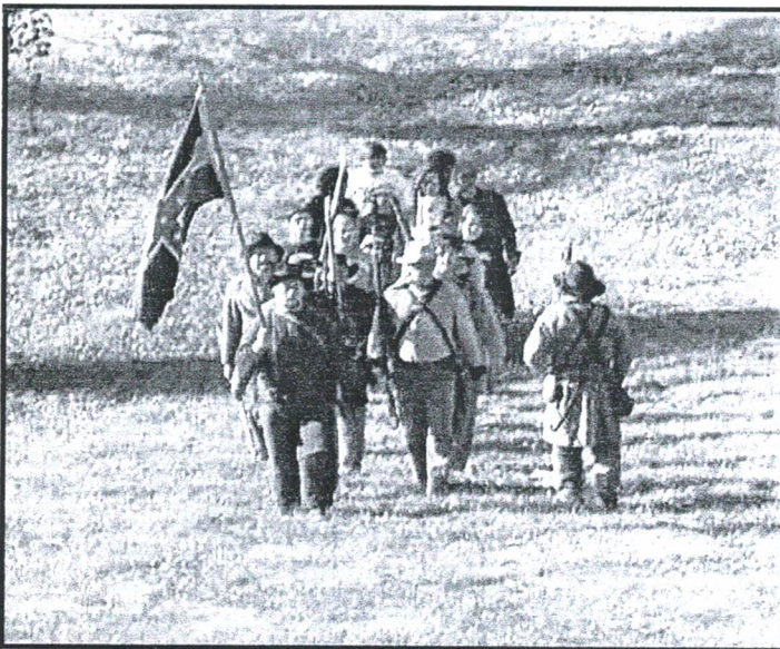
Marchers descend the hill on their way to Collin's Farm.