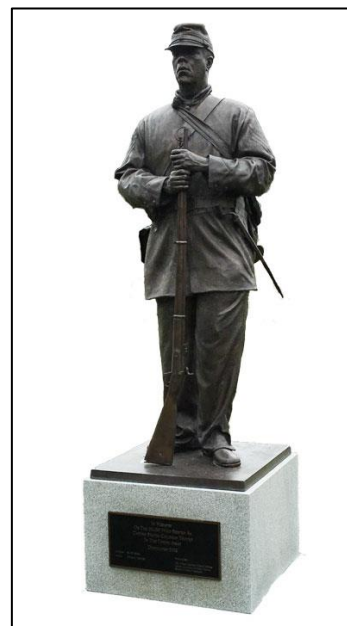
USCT Statue at Nashville National Cemetery in Madison

Visit https://boft.org/usct-statue to contribute.