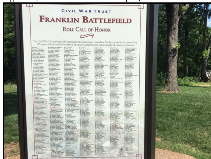
This 3-sided kiosk near the cotton gin lists the Civil War Trust donors who helped reclaim the Franklin Battlefield.

In February 2002, the CWT scheduled a Press Conference at the Carter House with the Heritage Foundation and STFB. The CWT announced that Franklin was now on their list of the Ten Most Endangered Battlefields. They also said the CWT was going to help Franklin preservation efforts with their donors and grant writers see March 2002 . This was big news, the salvation of future projects in Franklin.