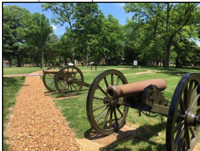
The Hinman Napoleon (far gun) completes the 6th Ohio Battery display near the cotton gin foundation, located about 15 – 20 yards to the rear of the guns.

The second Napoleon, donated in January 2019 by the Hinman family, completed the 6 th Ohio battery section display near the cotton gin. These two guns were placed in embrasures dug into the trench. The double canister from these two guns dominated the battlefield to the front. Every veteran who wrote of his experiences near the cotton gin describes the carnage inflicted by these two 12 pounders.