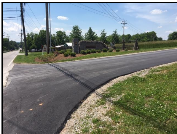
The entrance to Fort Granger from Eddy Lane is now paved.

The good news is that the Franklin Parks Dept has been gradually adding improvements to our battlefield parks as they find time.