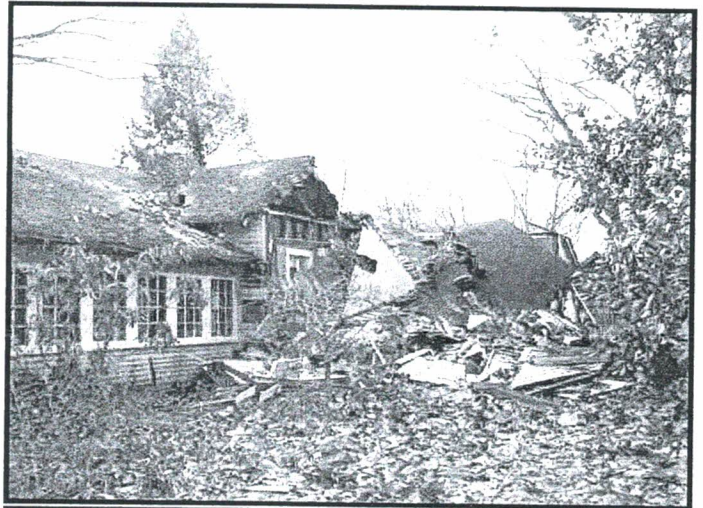
After the storm...