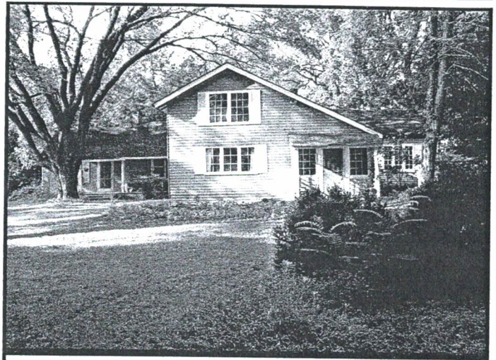
Before the storm....