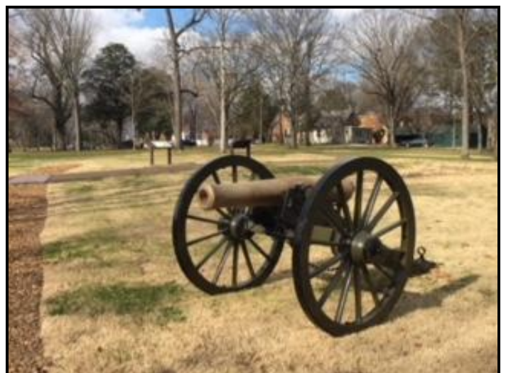
The gravel line on left marks the actual Federal trench line. The cotton gin foundation west wall can be seen just to the right of the gun tube.

A replica 12 pounder Napoleon cannon was installed near the Carter cotton gin just in time for the 153 rd anniversary of the battle. It represents the 6 Ohio battery that was positioned near this place.