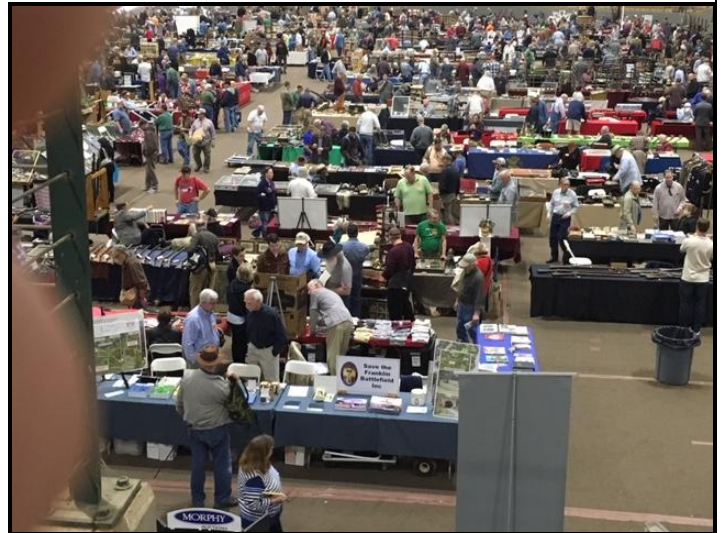
The STFB booth (foreground) seems almost lost in a sea of activity. This photo shows about half of the tables on the main floor. An upper level of tables surrounds the arena.

As always, STFB members stopped by to get the latest news about all of the projects underway by all of the preservation groups here in Franklin. Many are collectors or vendors from distant locales and come just for the show – and to talk with us. We also have visitors from the local area who know little about the Battle of Franklin and preservation efforts of the last 20 years. We are always eager to tell the story.