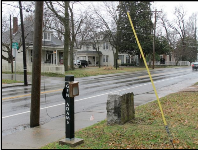
The two Lovell houses stand just south of the red-brick Carter House

The Save The Franklin Battlefield Board recently wrote to Franklins Charge committing $5,000 of its Land Purchase Fund for the purchase of the Lovell property. The target properties are the two houses adjacent to the south boundary of the Carter House State Historic Site. This ground was the scene of horrific hand-to-hand and point-blank trench-fighting for several hours in the darkness after the initial Confederate onslaught at the Battle of Franklin.