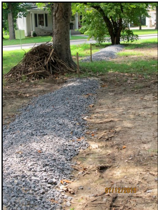
The excavated segments of the Federal trench line are now covered with gravel to identify and protect them. The two Lovell houses are directly across Columbia Avenue.

As we wait for the purchase of the two Lovell properties to finalize, some work is being done to fill in the Dominos and strip center foundations with top soil, cover the trenches with protective gravel, and generally grade and seed the park grounds. This is just a holding action until the Lovell deal closes. At that time, all of the properties held by the Heritage Foundation, Franklins Charge, and the Civil War Trust will be transferred to the City of Franklin for a City Park. After the two Lovell houses are moved, that property will also transfer to the City to complete a nearly 20 acre Carter Hill Battlefield Park.