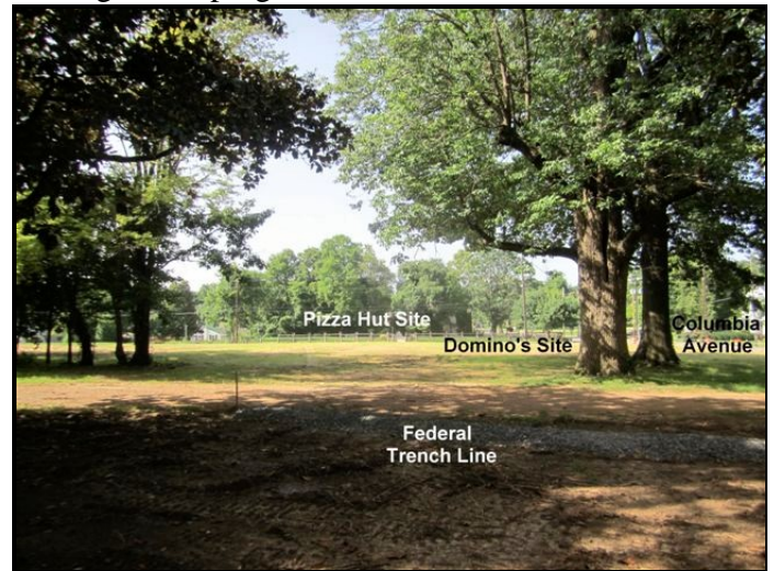
A current view of Carter Hill Battlefield Park looking south from the trench line.

The Franklin Parks Dept has already been budgeted to improve and interpret the new park with walking trails, benches, a parking area and other amenities. The park will also have the signature cedar rail fences that all Franklin Battlefield Parks now have. The interpretive signage will be created and donated by the National Heritage Area program at MTSU.