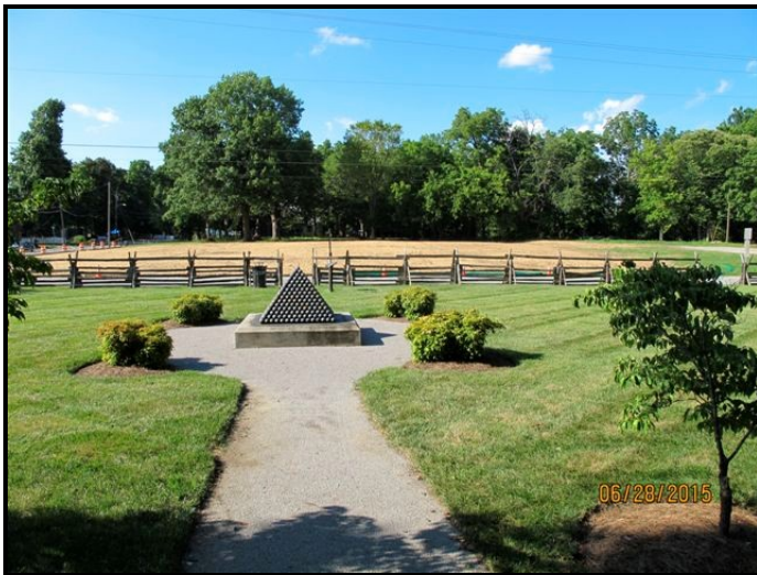
Carter Hill Battlefield Park as seen looking north across Cleburne Street from Pizza Hut site

As we wait for the purchase of the two Lovell properties to finalize, some work is being done to fill in the Dominos and strip center foundations with top soil, cover the trenches with protective gravel, and generally grade and seed the park grounds. This is just a holding action until the Lovell deal closes. At that time, all of the properties held by the Heritage Foundation, Franklins Charge, and the Civil War Trust will be transferred to the City of Franklin for a City Park. After the two Lovell houses are moved, that property will also transfer to the City to complete a nearly 20 acre Carter Hill Battlefield Park.