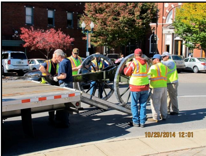
Streets Dept workers carefully winch the carriages onto the street at Franklin Square

There was great excitement on Franklin's Public Square October 29 when two of the new reproduction Civil War cannon carriages were delivered by Steen Cannon Works of Ashland, KY. They will mount our authentic Civil War 6-pounder cannons that were previously on concrete pedestals. The Cannons on the Square Committee principals and several City officials watched as the carriages were offloaded and wheeled into place.