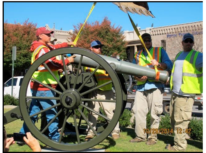
Workers position a carriage on its ground-level 3-point foundation and lower a cannon tube into place