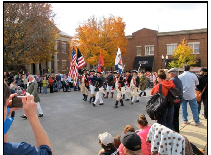
The Franklin Veterans Day Parade passes in review around the Square

Everyone watching the installation agreed that the Square now clearly announces to our visitors that they have arrived at a major Civil War Tourism destination.