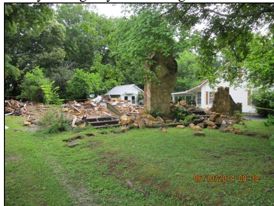
The brown stone house on Cleburne St. has been removed

The latest building to be removed on Cleburne Street is the brown-stone house just east of the blue house purchased years ago by the Heritage Foundation.