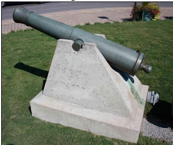
Current concrete stands to be removed

A local Engineering firm and a heavy crane company have both offered to assist in the site preparation and installation of the carriages.