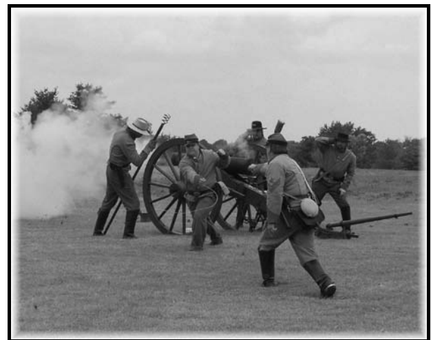
Artillerymen hard at work during the recent Franklin Symposium